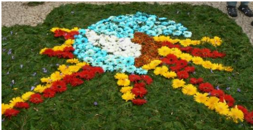
The holiday was delayed on Madeira until May to see the famous Flower Festival.