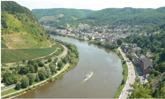
The Probus holiday this year was a week's river cruise on the Rhine and Moselle through Germany.