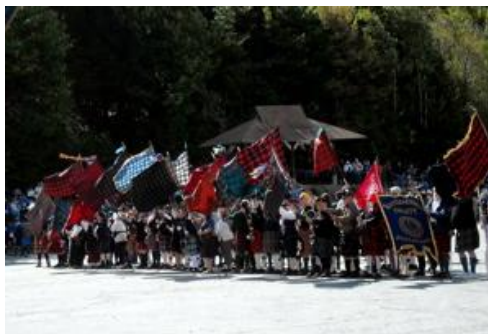
Gathering of the clans

The 1st Battalion Scots Guards, formed in the 17th century, were the guest band this year and were magnificent to watch as they marched and played. There was a Clan Parade with 63 Highland clans represented and the clan village held rows of tents, each one featuring a clan with representatives eager to sign up anyone who had a clan in their ancestry. Among the special events, a seminar on Bagpipes in the Movies given by a documentary film maker was especially interesting.